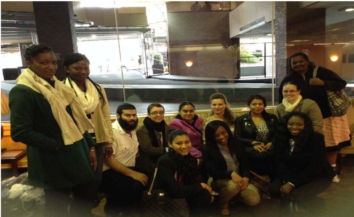
New York Methodist Hospital Visit

This spring, the Office of Career Development helped students explore diverse work environments through its Real World Visits. In March, students visited the Supreme Court of the State of New York and had an opportunity to gain valuable information about careers in law and the court system and also to explore some of those careers. In April, students met with the Human Resources Manager at the Marriott Hotel at Brooklyn Bridge , where they were taken on a comprehensive tour where students were able to see the hotel facilities and speak to staff within various departments including Human Resources, Housekeeping, and the Kitchen. In early May, students met with the Assistant Director of Public Relations at New York Methodist Hospital , where they were able to tour and meet with hospital staff within the Laboratory, Pharmacy, and Physical therapy departments.