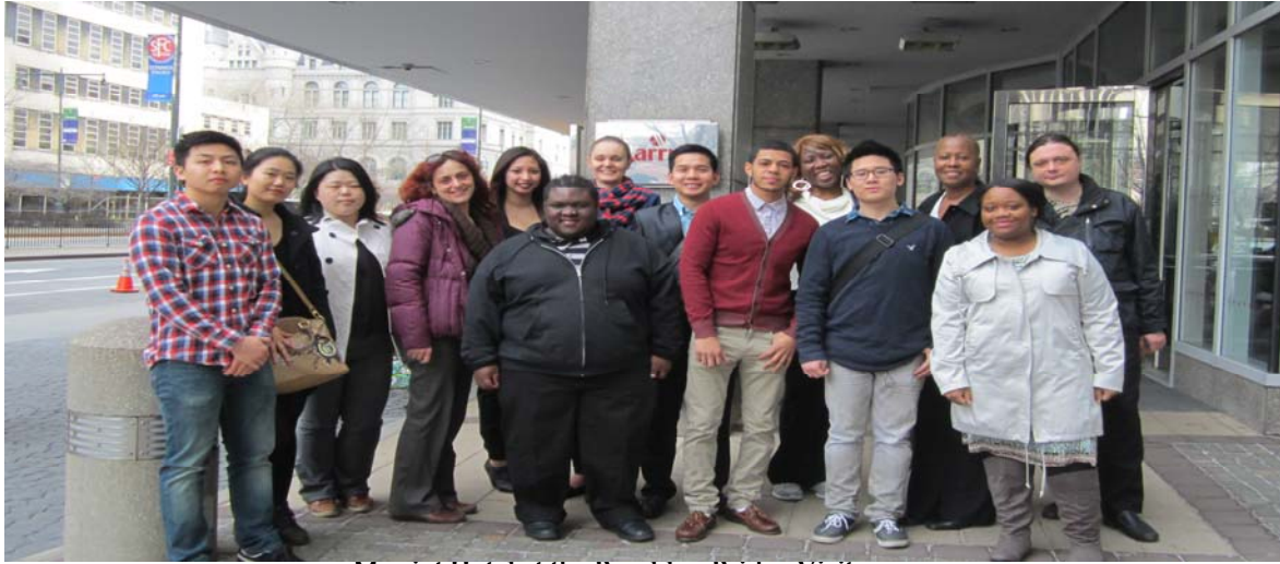
Marriot Hotel at the Brooklyn Bridge Visit

To end the spring season of Real World Visits, students visited 1010 WINS Radio Station and were able to obtain a close look at how a radio station works by speaking to staff and seeing radio equipment. Students heard insightful information and were able to ask diverse questions about radio broadcast news and getting started in the business by speaking to the Director and Assistant Director of News and Programming. Through the Real World Visits, students have been able to network with diverse staff and gain real world insights about working in different industries. We thank the Supreme Court, Marriott