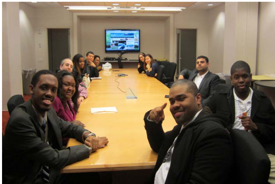
1010 Wins Radio Station Conference Room

Please visit C-102 to learn about upcoming visits!